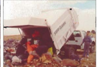
Light weight design maximizes chassis payload capacity.

Liquid & powder paint process achieves a high gloss, durable finish.