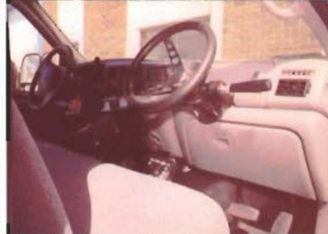
Available with dual steering to collect with the traffic flow. (Ford F550 only)