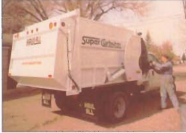
Lowest loading height in its class.