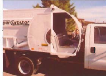
Full width loading hopper minimizes required cycles.